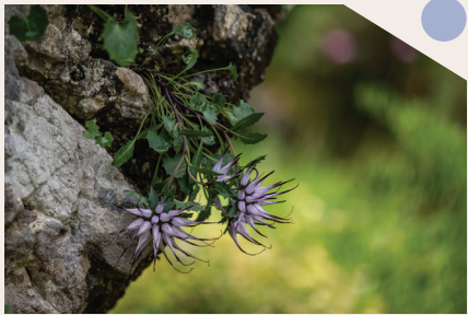
Tufted horned rampion ( Physoplexis comosa )