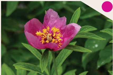
Common peony ( Paeonia officinalis )