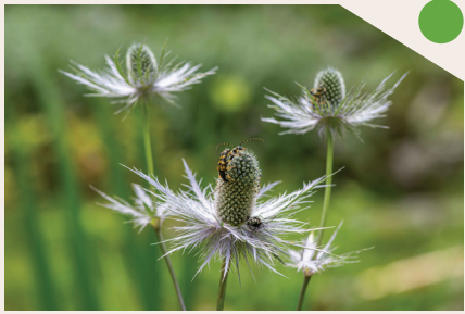
No less than 70 plant species, which are protected by law in Slovenia, prosper in Juliana, including the alpine eryngo ( Eryngium alpinum ).