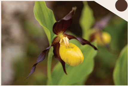
Lady's-slipper ( Cypripedium calceolus )