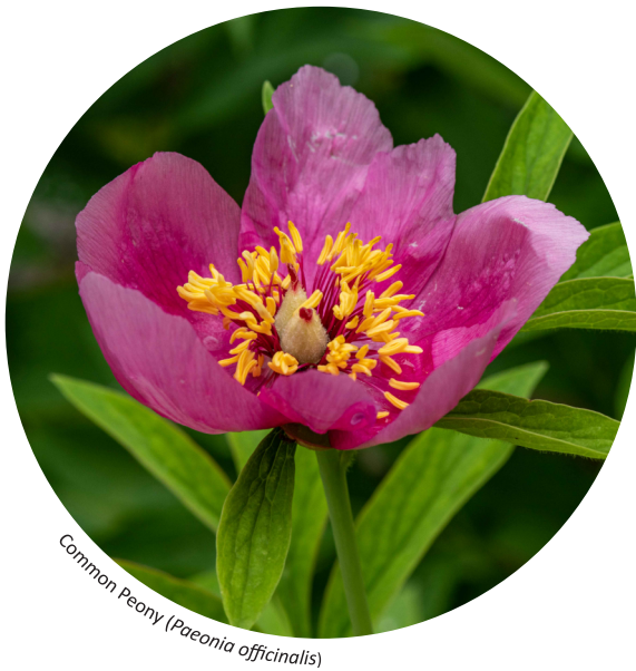
Common Peony ( Paeonia officinalis )

The Soča Trail is a nature trail leading visitors along the Soča River from its source towards Bovec. The tour is guided by the Triglav National Park rangers, while tours through Juliana are guided by the employees of the Slovenian Museum of National History. The assembly point is in front of the Chalet at the Soča source. The entrance fee to Juliana is 2 € (payable at garden entrance); for children, the entrance to Juliana is free of charge.