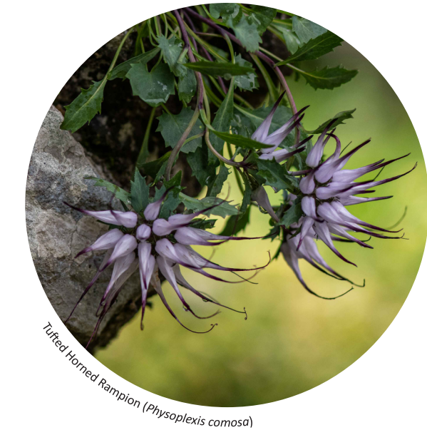
Tuffed Horned Rampion ( Physoplexis comosa )

What's all that buzzing over there? Prisoners of climate changes True tales and legends told by Juliana A colourful show Rare and unique The Soča Trail Rare and unique Paper Flowers Workshop With Zoisy the Dwarf through Juliana The Soča Trail With Zoisy the Dwarf through Juliana Medicinal or poisonous? The Soča Trail Medicinal or poisonous? Paper Flowers Workshop In the footsteps of Scabiosa trenta Travelling seeds Paper Flowers Workshop