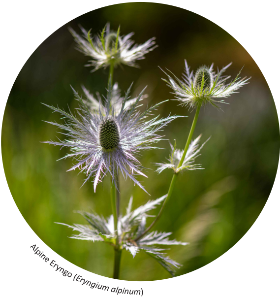
Alpine Eryngo ( Eryngium alpinum )